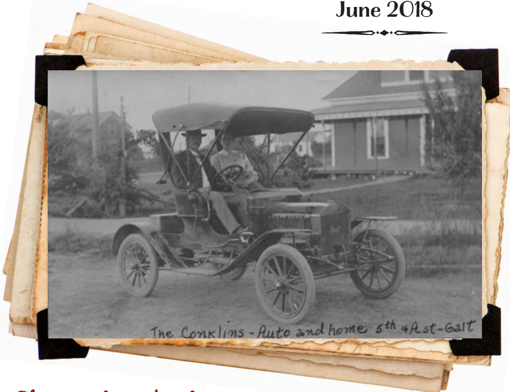
The Conklins - Auto and home, 5th & A St - Galt